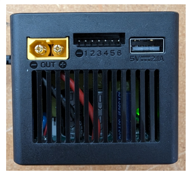
Figure 3. Location of OUT port.

Correct Battery Connection: To properly charge the battery, the battery cable should be connected to the OUT port shown below.