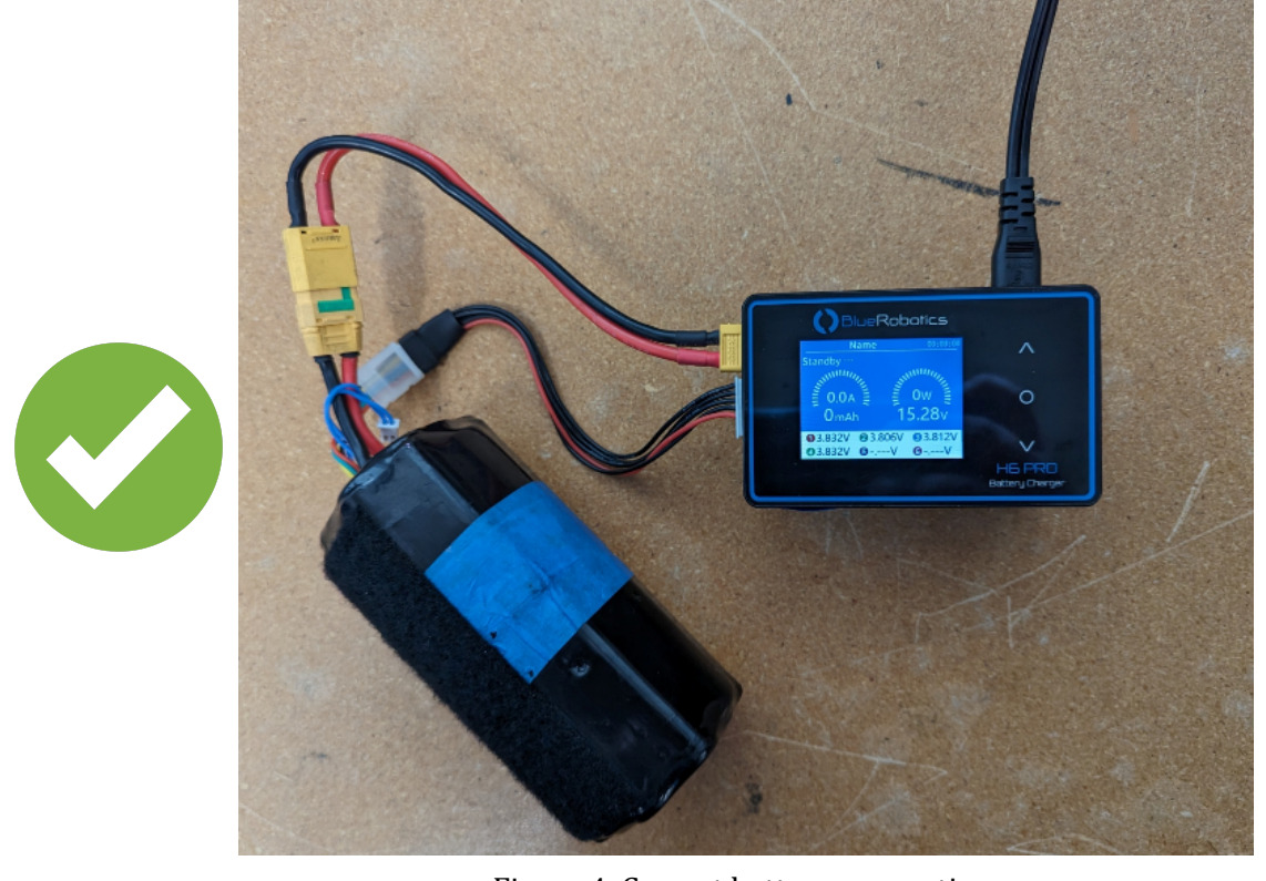
Figure 4. Correct battery connection.

CUSTOMER ACTION: Carefully review and understand this information as well as the <u>H6</u> <u>Pro charging instructions</u> to prevent incorrect operation of the charger. This information should also be shared with any person that will operate the charger.