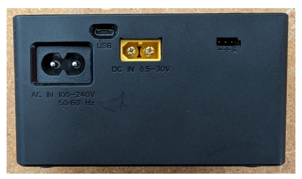
Figure 1. Location of DC IN and AC IN ports

IDENTIFICATION: Fire risk is only present when a battery is connected to the DC IN port while the charger is connected to AC power, as shown below.