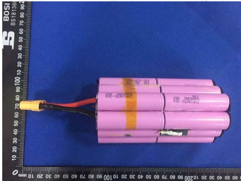
Photo 3 Internal Cell 内部电芯